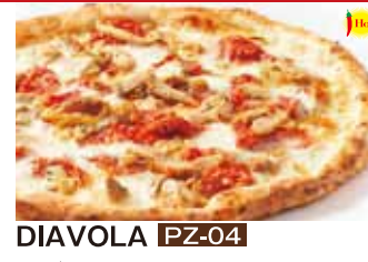
DIAVOLA PZ-04 ¥2,080

Devil's Pizza with spicy salami and herb flavored chicken.