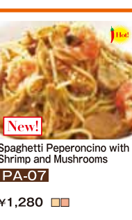
Spaghetti Peperoncino with Shrimp and Mushrooms PA-07 ¥1,280