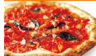
MARINARA No.1 PZ-03 ¥1,680

The No.1 traditional Neapolitan Pizza with an abundance of four different kinds of tomatoes.