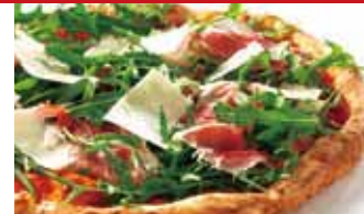
PROSCIUTTO & RUCOLA PZ-10 ¥2,580

[Ice fish, Whitebait, Rucola, Botargo, Cherry tomato, Laver, Caper, Anchovy, Oregano, Garlic, Cream, Mozzarella]