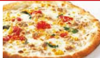
BAMBINO PZ-06 ¥2,080

[Tomato, Eggplant, Anchovy, Black olive, Garlic, Red pepper, Caper, Oregano, Mozzarella]