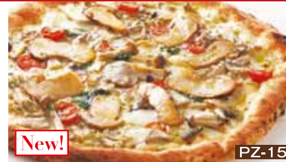
PIZZA MATSUTAKE PZ-15 ¥2,680

[Smoked salmon, Enoki, Eringi, Shimeji, Mushrooms, Rucola, Caper, Cream, Mozzarella]