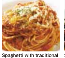
Spaghetti with traditional Italian Meat Sauce PA-03 ¥1,100