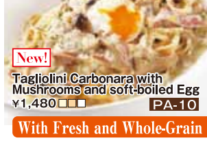
Tagliolini Carbonara with Mushrooms and soft-boiled Egg PA-10 ¥1,480

For best taste, we deliver our special sauce and pasta in separate containers.