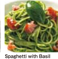
Spaghetti with Basil and Sausage PA-01 ¥1,300