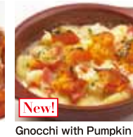
Gnocchi with Pumpkin and Bacon PA-08 ¥1,100