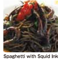
Spaghetti with Squid Ink PA-04 ¥1,200