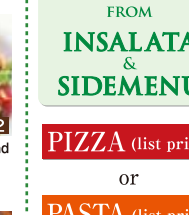
Country Salad with Tuna and various toppings SD-02 ¥680