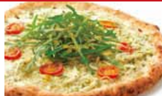
PIZZA WITH ITALIAN BOTARGO PZ-16 ¥2,480

[Honey, Gorgonzola, Edam, Samsoe, Black olive, Mozzarella]