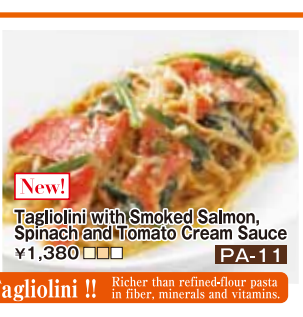
Tagliolini with Smoked Salmon, Spinach and Tomato Cream Sauce PA-11 ¥1,380

With Fresh and Whole-Grain Tagliolini !! Richer than refined-flour pasta in fiber, minerals and vitamins.