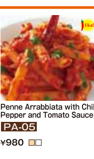
Penne Arrabbiata with Chili Pepper and Tomato Sauce PA-05 ¥980