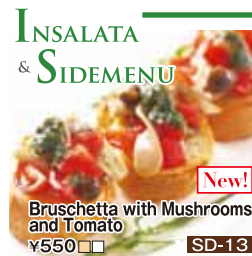
Bruschetta with Mushrooms SD-13 ¥550