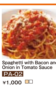
Spaghetti with Bacon and Onion in Tomato Sauce PA-02 ¥1,000