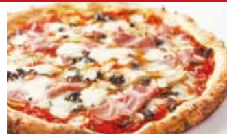
CAPRICCIOSA PZ-07 ¥2,180

[Tuna, Corn, Mushrooms, Basil, Tomato, Cream, Mozzarella]