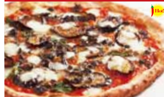
CALABRESE PZ-05 ¥2,080

Spicy and stylish Pizza with fried eggplant and an accent of delicious Calabrian hot pepper.