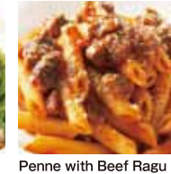
Penne with Beef Ragù PA-06 ¥1,350