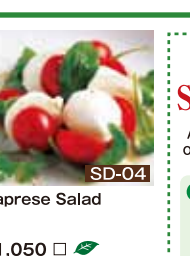
Caprese Salad SD-04 ¥1,050