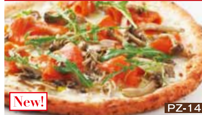
PIZZA WITH SMOKED SALMON AND MUSHROOMS PZ-14 ¥2,280

Autumn Pizza of 4 kinds of mushrooms topped with smoked salmon.