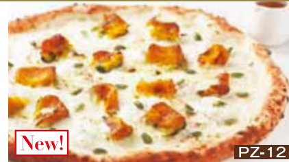
ZUCCA ~Accompanied by Italian BIO Honey~ PZ-12 ¥2,180

[Tomato, Eggplant, Caper, Basil, Spicy Salami, Oregano, Ricotta, Mozzarella]