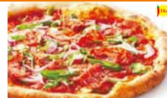
PIZZA 'NDUJA PZ-08 ¥1,780

[Tomato, Cherry tomato, Midi tomato, Semi dried tomato, Oregano, Basil, Garlic]