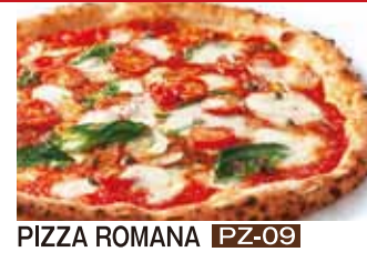
PIZZA ROMANA PZ-09 ¥2,080

[Chicken, Salami, Red Pepper, Garlic, Mozzarella]