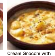
Cream Gnocchi with 4 kinds of Cheese PA-09 ¥1,080