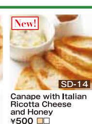
Canape with Italian Ricotta Cheese and Honey SD-14 ¥500