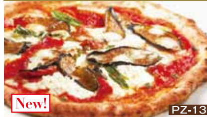
ETNA PZ-13 ¥2,280

Pizza with fresh Italian ricotta cheese, fried eggplant and spicy Neapolitan salami. Enjoy the pleasing harmony.