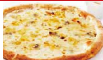
PIZZA WITH 4 TYPES OF CHEESE PZ-11 ¥2,280

[Tomato, Mushrooms, Artichoke, Prosciutto, Black olive, Mozzarella]