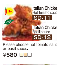
Italian Chicken Hot tomato sauce SD-11 ¥580