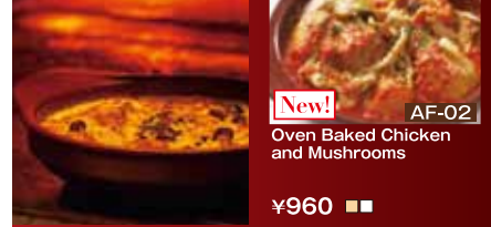
Oven Baked Chicken and Mushrooms AF-02 ¥960

Hot and savory dishes baked in our signature oven